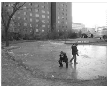
Children on the ice

It happened on a spring day. A girl of about twelve was going home after school. When she was approaching a river, she suddenly heard cries. The girl hurried in that direction and saw two small children on a piece of ice. She immediately made up her mind, and a minute later she was down on the ice. Very quickly she reached the children. They had calmed down a little and she saw the smaller boy fall into the water. The girl immediately lay down on the ice and caught the boy by the hand. Though it was very dangerous and she was very tired, she continued lying in this position until two men saw them. They first carried them to a safe place on the bank and then took them to the nearest hospital.