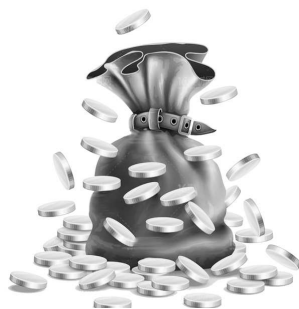
The sound of coins

The restaurant owner was very angry at this, and he asked the man for money, in exchange for the smell. The poor man had no money, so the restaurant owner took him to Nasreddin, who was a judge at that time. Nasreddin thought about the case for a little while. Then he took some money from his pocket. He held the coins next to the restaurant owner's ear, and shook them, so that they made a noise. "What was that?" asked the restaurant owner. "That was payment for you," answered Nasreddin. "What do you mean? That was just the sound of coins!" protested the restaurant owner. "The sound of the coins is payment for the smell of the soup," answered Nasreddin.